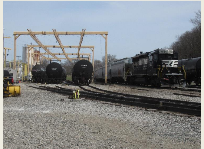
Top photo was taken at the ADM Corn Syrup facility, Battle Creek, MI.