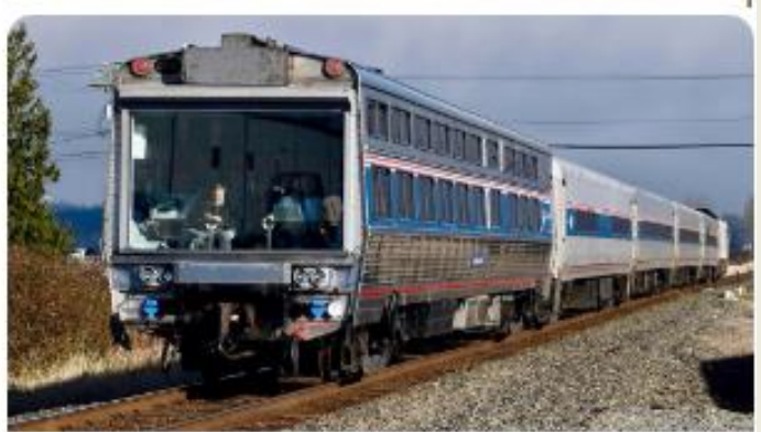
Amtrak Inspection Train Car: American View youtu.be

This train seemed longer (extra cars), but look at the end with the last car. I have not seen that kind of car and view except on a "business car/train". Rich Mahaney