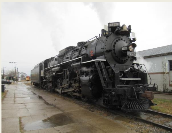
This photo is the Pere Marquette Steam Engine # 1225, from the Steam Railroading Institute.