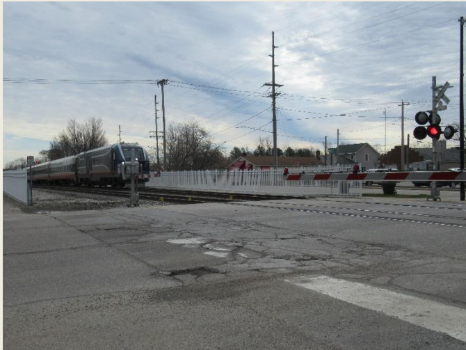
Left photo is of a west bound Amtrak on Sunday April 10th, going through Three Oaks, MI, probably at 100 mph or more.