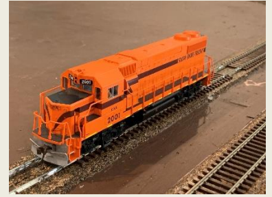
The above locomotive is an Atlas HO GP 38-2 Chicago South Shore # 2001, which I acquired from Rider's Hobby Shop in Grand Rapids.

Last month was more of an introduction covering how I got back into Model Railroading and covering the last four years of activities. This month will be more of what has been accomplished on my new layout over the last two years.